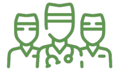
The number of persons per provider varies greatly by county, and by type of provider (2021)

The ratios of mental health providers to the population was much higher in the counties of Nuckolls, Webster, and especially Clay. Primary care providers (as primary managers for patients with psychiatric conditions) were also less available in Webster and Clay Counties.